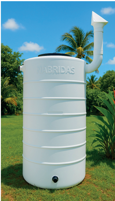
non contractual images