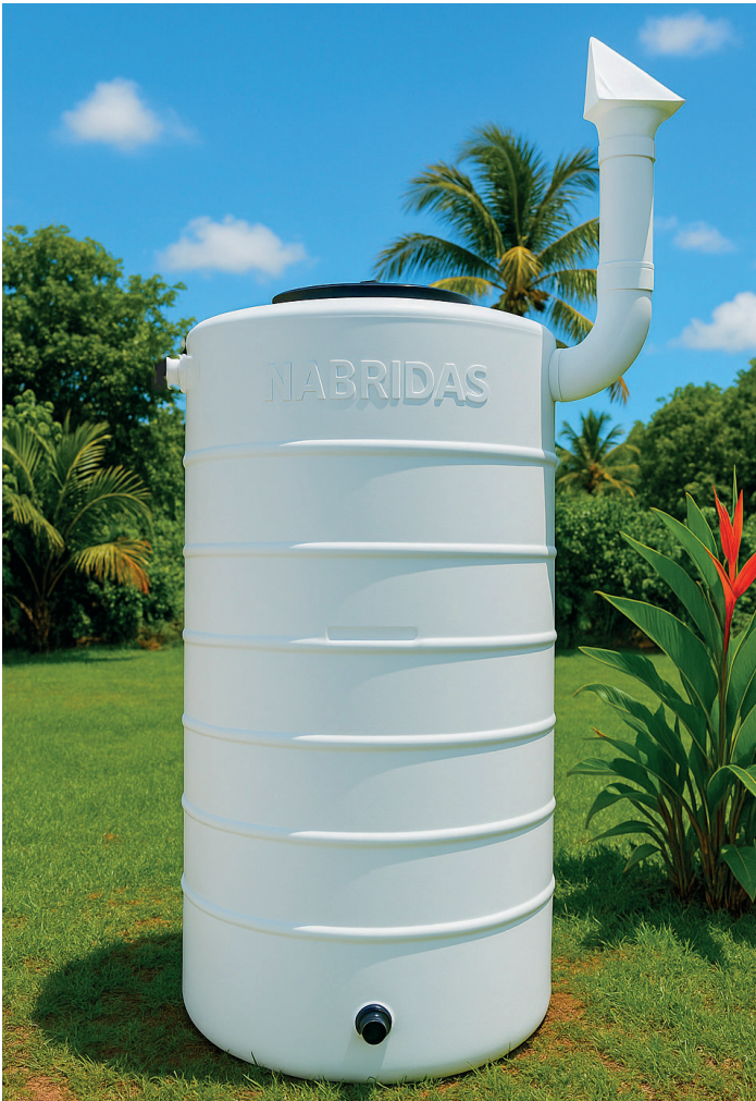
non contractual image