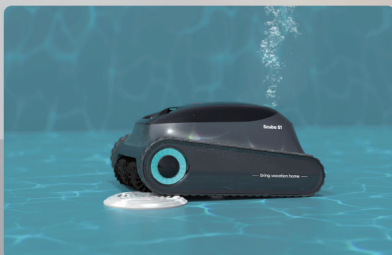
Caterpillar Treads for Superior Mobility