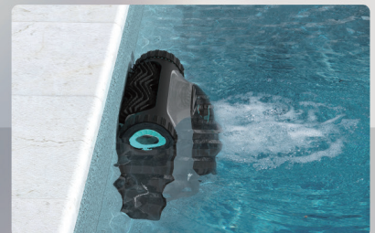
Wall Cleaning Capabilities